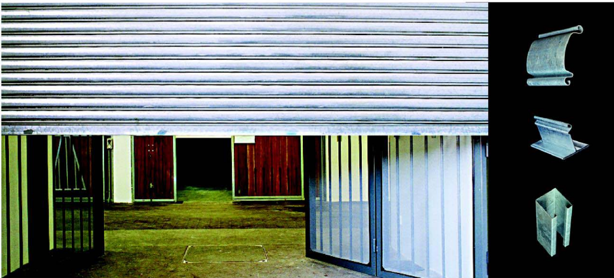
GMS shutters at 2008 Olympic Equestrian Venues

Material: GS: galvanized mild steel SS: stainless steel ◦ : available