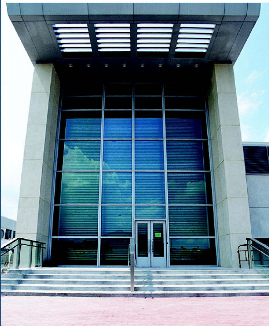
10000mm (W) x 11000mm (H) GMS shutter.